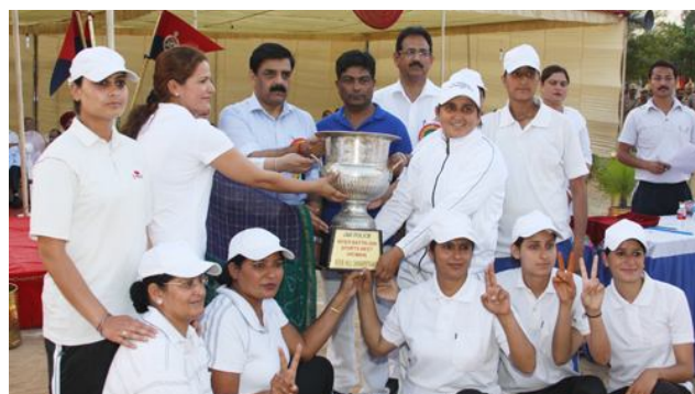
Winners of overall Championship trophy in Women's category (IRP 15 th Bn.)

A total of 900 sports personnel including 130 women players, representing 28 Battalions of IRP and Armed Police, participated in the tournament to showcase their talent in varied disciplines including Basketball, Volleyball, Football, Handball, Tug-of-war, Boxing, Wrestling, Weight lifting, Swimming, Shooting, Hockey, Kabbadi, Marathon, Short-put, hammer throw, javelin throw, discus throw, long jump and high jump. Besides, sports person from officer ranks of the different battalions participated in Badminton, Table Tennis, Lawn Tennis and Shooting.