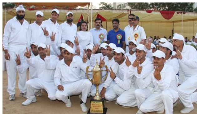
Winners of overall Championship trophy in Men's category (IRP 19 th Battalion)